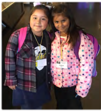
Children discover the Exploratorium

Please join us for EPAK Day on Thurs., May 31 at 9am at Willow Oaks Elementary School. See first-hand how your donations and efforts are making a difference. Contact info@epak.org to register.