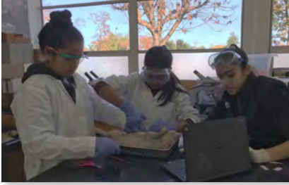
A memorable science lab at Ravenswood Middle School

By supporting EPAK, you play a key role in helping teachers focus on engaging their students and preparing them for the bright future they deserve. Here is a sample of the many ways EPAK made a big difference this school year: